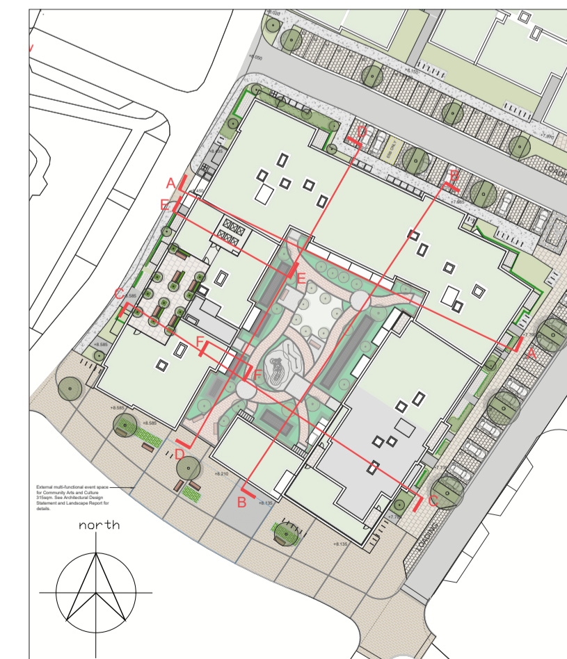
KEY PLAN FOR SECTIONS - NTS