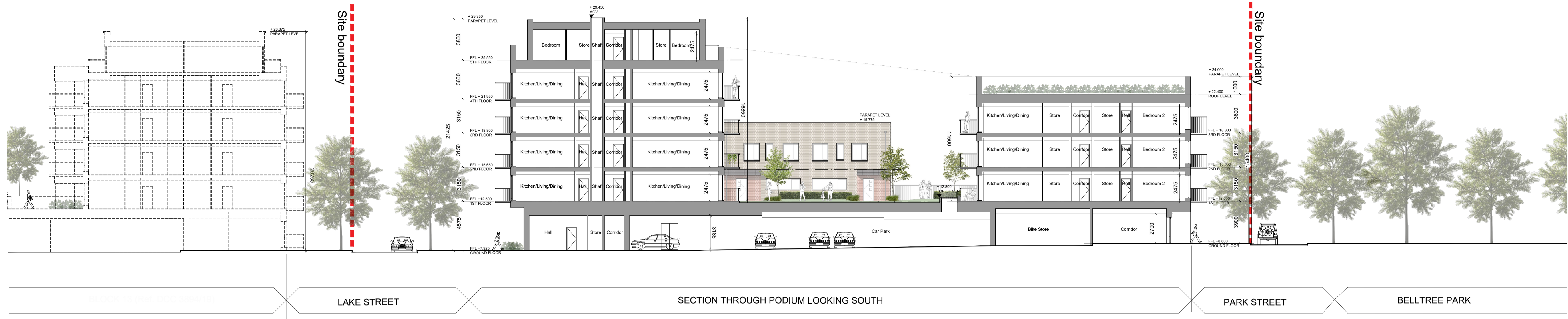
BLOCK 5 - SECTIONAL ELEVATION C-C LOOKING SOUTH scale 1:200@A1